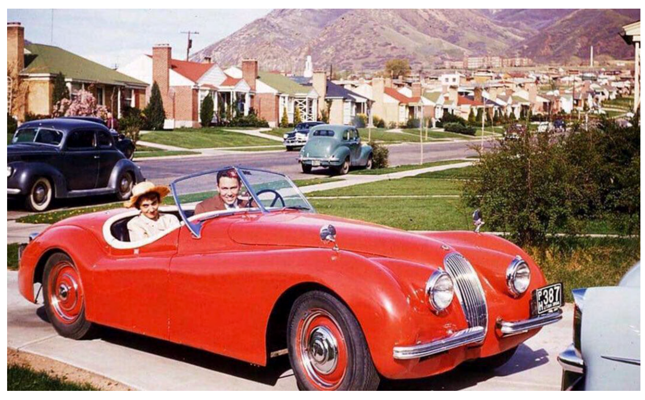
One of the earliest Jaguar XK-120s in Utah