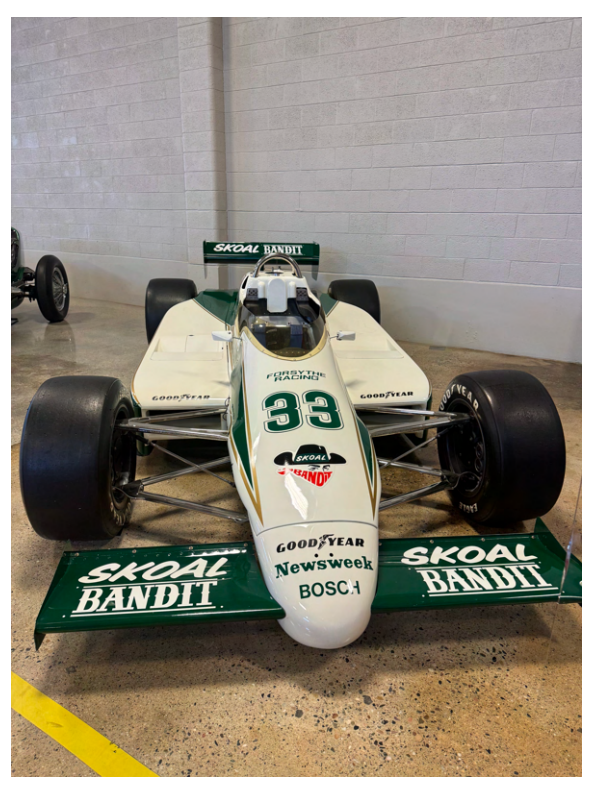
More photos from this event are on our website. https://www.wmjr1976.org/price-museum-of-speed