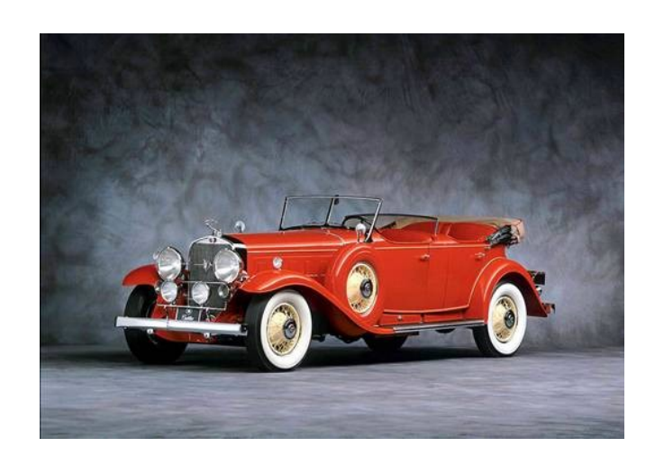
A13: The 1930 Cadillac 452, the first production V16