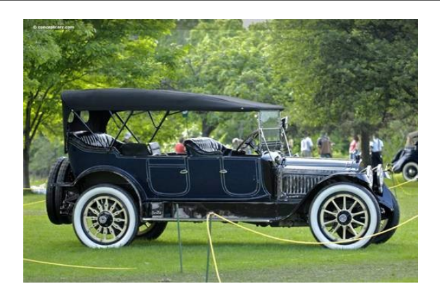
A26: The 1915 Packard Twin-Six. Used during WWI in Italy, these motors inspired Enzi Ferrari to adopt the V12 himself in 1948.