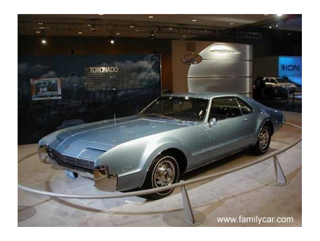
A15: March 16, 1966 saw an Olds Tornado roll out of Lansing, Michigan with that honor.