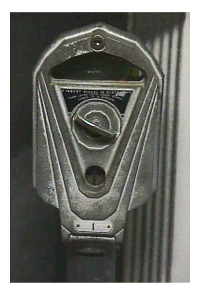
A3: Oklahoma City, on July 16, 1935.