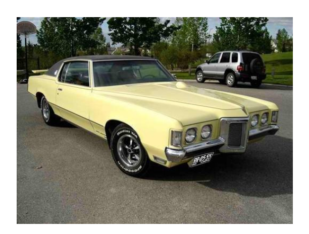
A12: The 1969 Pontiac Grand Prix.