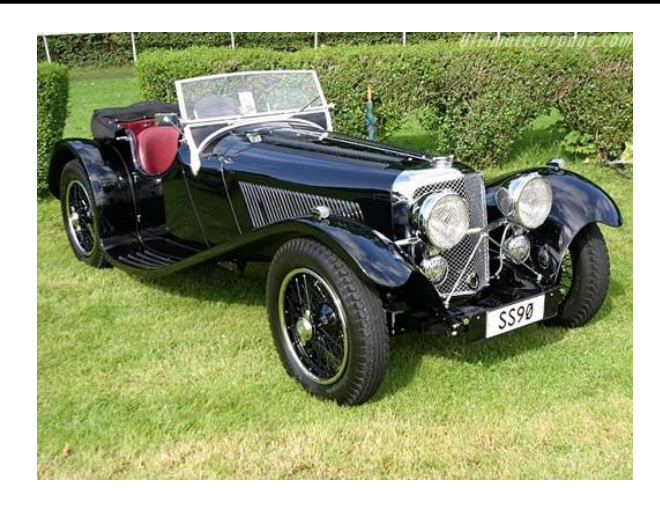
A29: Jaguar, which was an SS model first in 1935, and ultimately the whole company by 1945.