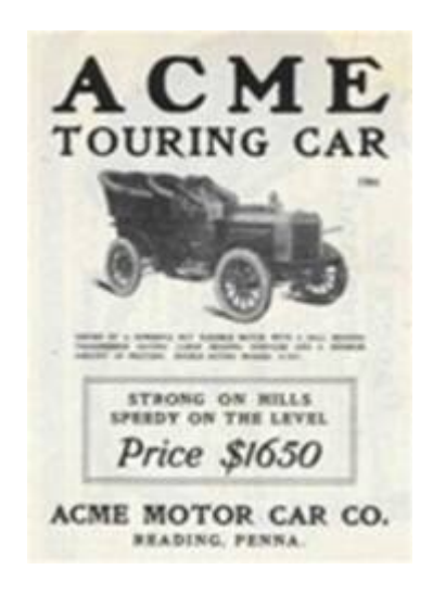
A9: The 1904 Acme, from Reading, PA. Perpetuity was disturbing in this case, as Acme closed down in 1911.