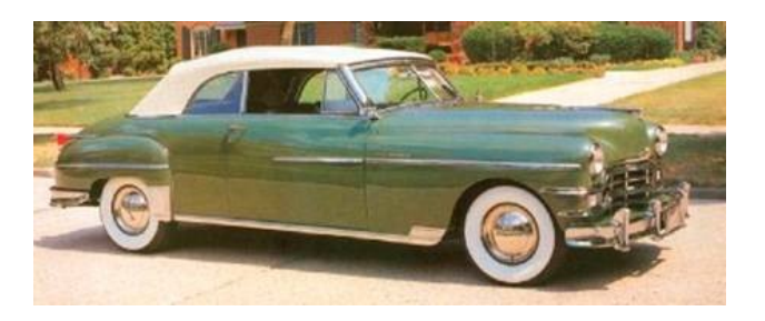
A17: The 1949 Chryslers