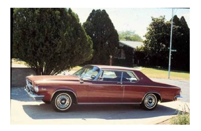
A28: Only 400, 1963, 300J's were sold (they skipped "I" because it looked like a number 1)