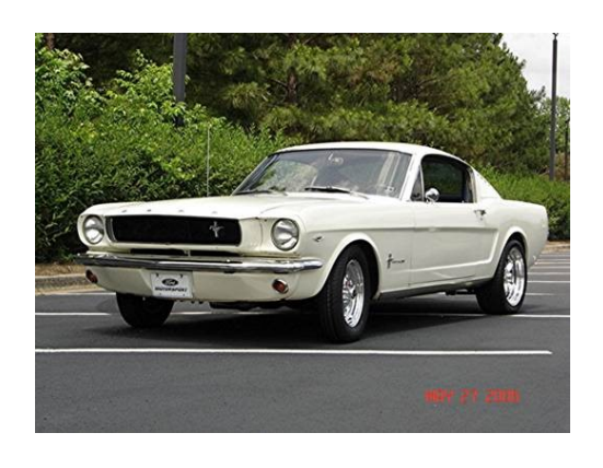
A21: The Mustang