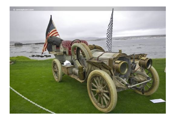
A35: The 1907 Thomas sported a 571 cu. in. (9.2liter) engine.