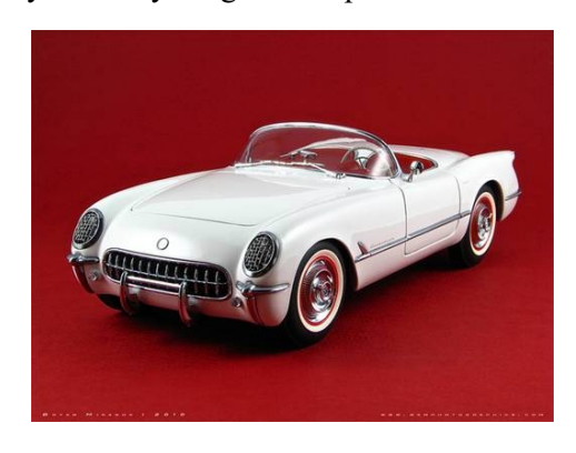
A5: False. The 1953 'Vette's were available in one color, Polo White.