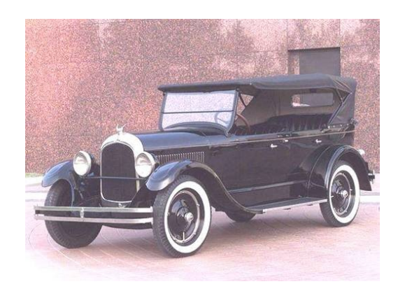
A8: The 1924 Chrysler.