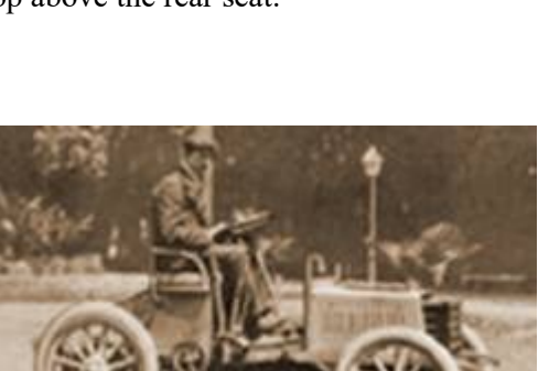
A33: Bugatti, founded in Molsheim in 1909, became French when Alsace returned to French rule.