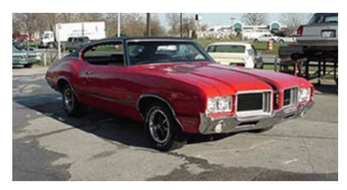
A18: 4 barrel carburetor, 4 speed transmission, and dual exhaust.