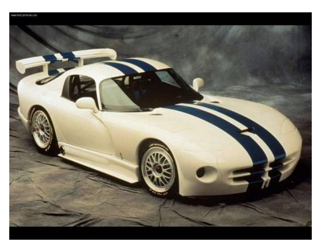
A23: The 1998 Dodge Viper GETS-R, tested by Motor Trend magazine at 192.6 mph.