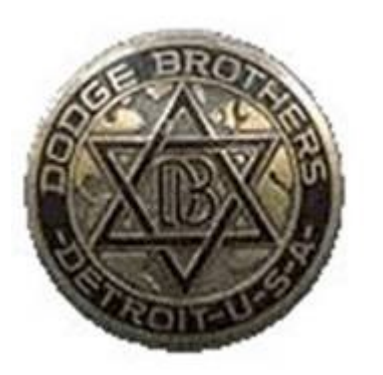
A24: The Dodge Brothers.