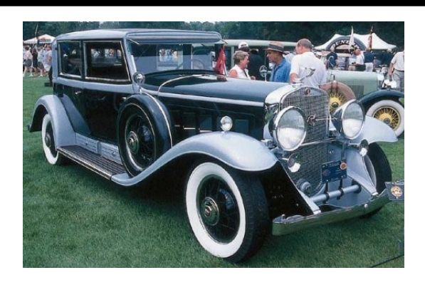
A32: The "Madam X", a custom coach designed by Earl and built by Fleetwood. The sedan featured a retractable landau top above the rear seat.