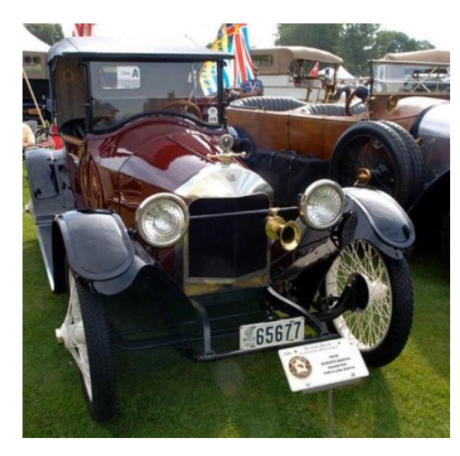
A19: The 1915 Scripps-Booth Model C. The car also was the first with electric door latches.