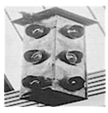
A14: Detroit, Michigan in 1919. Two years later they experimented with synchronized lights.