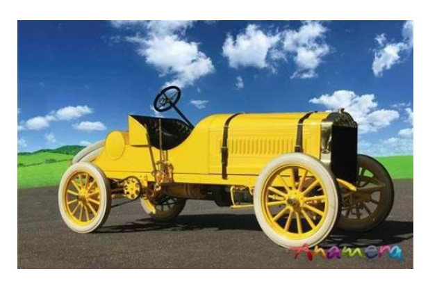
A11: The 1904 Thomas Flyer, which had a removable hard top.