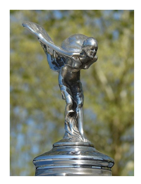
A37: The official name of the mascot of Rolls Royce, she is the lady on top of their radiators.