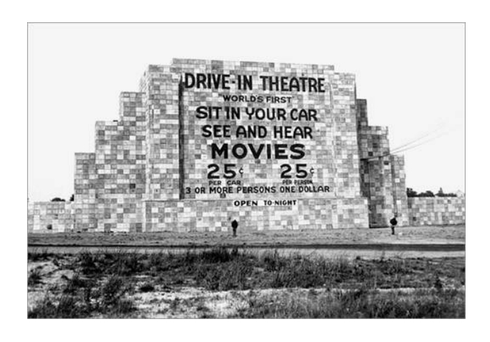
A16: Camden, NJ in 1933