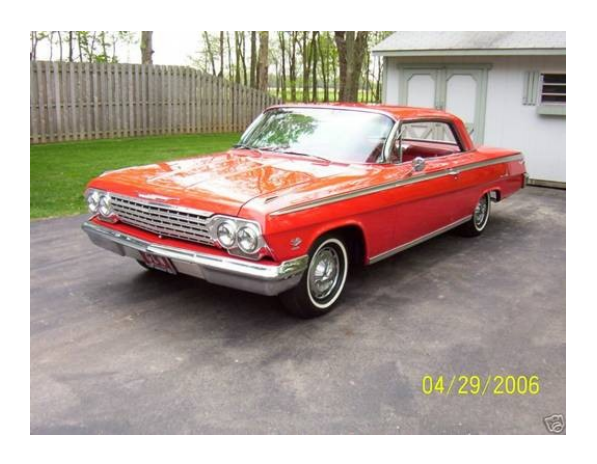
A20: The 1962 Chevrolet Impala SS 409. Did it in 4.0 seconds.