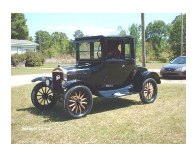
A22: The 1925 Ford Model T Runabout. Cost $260, $5 less than 1924.