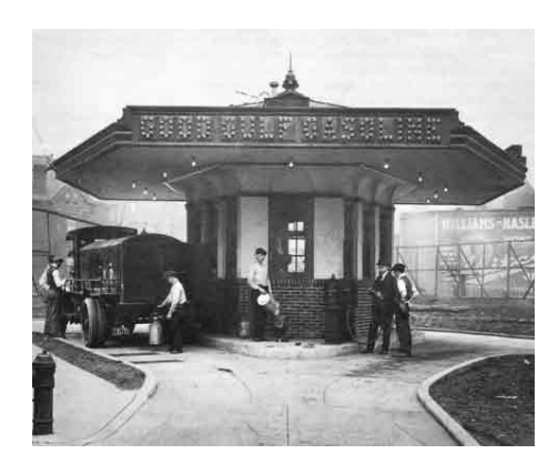
A2: Gulf opened up the first station in Pittsburgh in 1913.