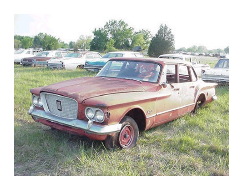
A7: The 1960 Plymouth Valiant.