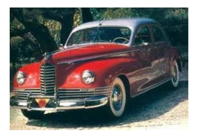
A27: They were first used on the 1947 Packard line.